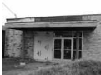
A snapshot of 9 Princess St. East, about Oct/06

We would like to distribute future versions of Lights Up! electronically, however do feel free to contact us if you would prefer to receive a paper copy of this newsletter. Please contact the Editor at lightsup@kwlt.org or leave a message on the KWLTL phone line at 519-886-0660.